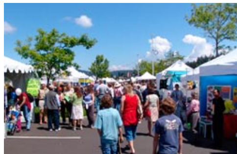
Despite a bit of rain on Saturday, crowd size was very good, especially on sunny Sunday.