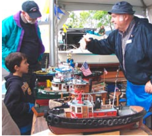
There was no mistaking the theme of the Waterfront Festival this year: boats, family and fun!