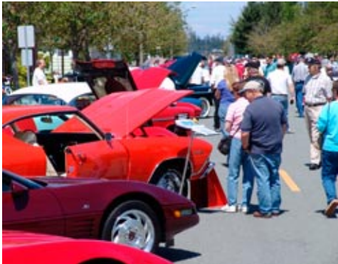
Classic car shows both Saturday and Sunday were very popular again this year.