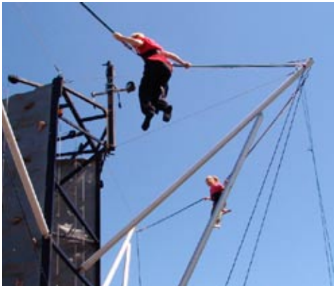
The new bungee-bounce portion of the rock-climbing tower was a big hit with the kids and had non-stop lines throughout the festival.