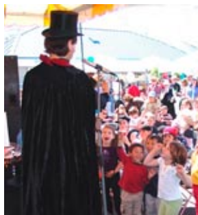
The magician from Uncle Stinky's Magic put on a fun and interactive show for the kids.