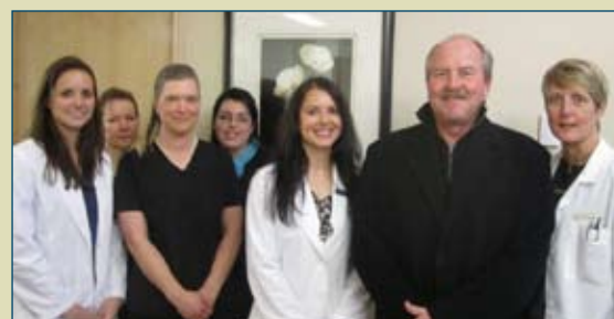
The staff at Rosaio Skin Clinic with Mayor Maxwell.