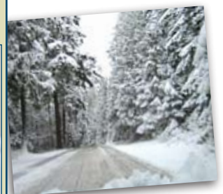
Lest you forget our "winter extreme" commute last month.