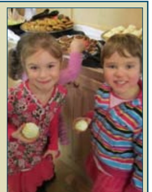
"Ribbon cuttings are the bestest parties ever!"