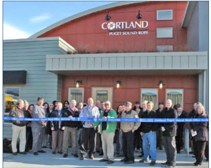
In November, the Port of Anacortes celebrated the opening of the new office building for long-term tenant, Puget Sound Rope. This is the first new port-built building on port property in 15 years.