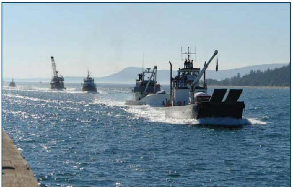
The second annual workboat races took place in July along Guemes Channel. The chamber co-sponsored the event.

· Member-to-member only version of our Hot Deals – select that option when submitting your Hot Deal request