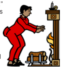
YOUR STOVE SHOP

is: "Education is free." Prepurchase previews are a part of the free service they offer. Even if you are still in the "just dreaming about it" phase they encourage you to call or stop by with your ideas and questions.