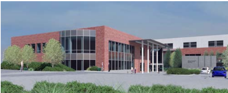
The Medical Arts Pavilion at Island Hospital opens in January. Included in the 26,000-square-foot building are a new Wound Care Center, Merle Cancer Care Center and Physical Therapy Center.

Medical Arts Pavilion at Island Hospital holds ribbon cutting, open house in January.