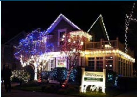
First Place: Strandberg Construction