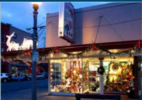
First Place: Buer's Floral & Gift