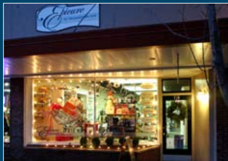
Second Place: Epicure... for the Passionate Cook