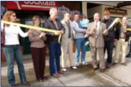
January 21 "block party" on Commercial Ave.

City, county and business people gathered on a sun-splashed Commercial Avenue Friday, January 21 to acknowledge completion of another downtown Anacortes block upgrade.